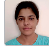
ANITA AIR 300 Reg. No. PH21523028111