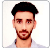
NIKHIL AIR 322 Reg. No. PH21523010213