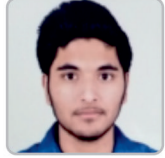
CHANDAN AIR 177 Reg. No. PH21528003061