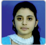
PALKI AIR 493 Reg. No. PH21523018499