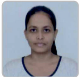
SUVIDHA AIR 607 Reg. No. PH21523028473