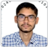
GAURAV AIR 404 Reg. No. PH22555024096