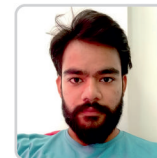
NILESH AIR 352 Reg. No. PH22553029677