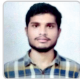
AMIT AIR 543 Reg. No. PH22553002174