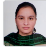
SEEMA AIR 188 Reg. No. PH22558021441