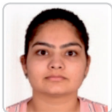
CHITRALEKHA AIR 239 Reg. No. PH22558021353