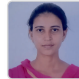
SONIA AIR 739 Reg. No. PH22553009160