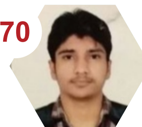
AKSHAY CY306F400 (SRI VENKATESWARA)