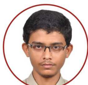
AMLANJYOTI AIR 42 Reg. No. CY617A576