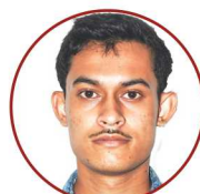
BANIBRATA AIR 50 Reg. No. CY617A220