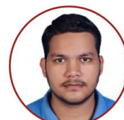
ABHINASH AIR 822 Reg. No. CY605A221