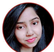
IBTESHAM TARANNUM AIR 612 Reg. No. CY413A204