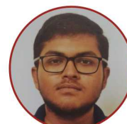
DEBKUMAR AIR 81 Reg. No. CY616A488