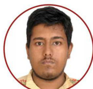
UDDALAK AIR 33 Reg. No. CY618A096