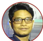
ANINDYA AIR 45 Reg. No. CY613A126