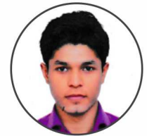
LUCKMAN KHAN AIR 2188 Reg. No. BT317F255