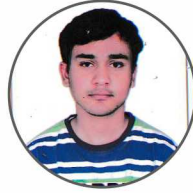
HARDIK AIR 88 Reg. No. BT317F107