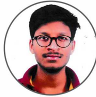
PRINCE SISODIYA AIR 08 Reg. No. BT317F311