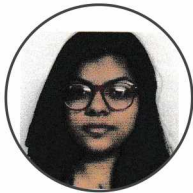
NEELAM AIR 1115