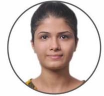
ANU MIDHA AIR 41 Reg. No. BT320F116