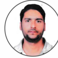
KAISER RASOOL AIR 250