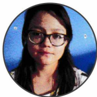
MAITRAYEE AIR 4004