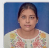
VIPUL AIR 957 Reg. No. PH25578043019