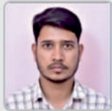
MOMIN AIR 125 Reg. No. PH25573021106