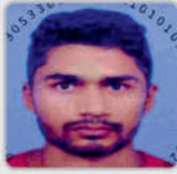
MAYANK AIR 690 Reg. No. PH25573053309