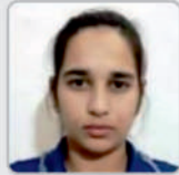
SIMRAN AIR 487 Reg. No. PH25573017088