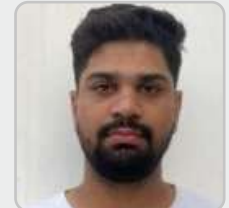
YOGESH AIR 567 Reg. No. PH26S23044141