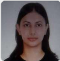
PRIYANKA AIR 34 Reg. No. PH26S28001258