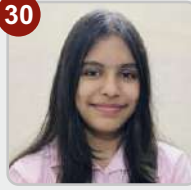
PALAK AIR 30 Reg. No. PH314A063