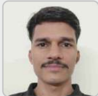
YOGESH AIR 128 Reg. No. PH320A078