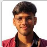
SHOBIT SHEKHAR AIR 101 Reg. No. PH321A269