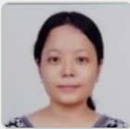
LEEZA RANA AIR 148 Reg. No. PH312A407