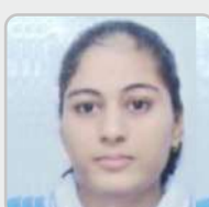
KARTIKA Reg. No. PH308A044