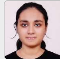
BHUMIKA AIR 127 Reg. No. PH314A428