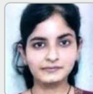
DEEPIKA AIR 949 Reg. No. PH305A094