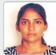
NAVYA AIR 609 Reg. No. PH305A068